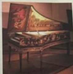
大鍵琴 鍵盤樂器 Harpsichord Keyboard instrument