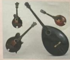
曼陀林 弦樂器 Mandolin String instrument

There are two people in this painting. The teacher is tuning the musical instrument.