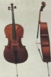
大提琴 弦樂器 Cello String instrument