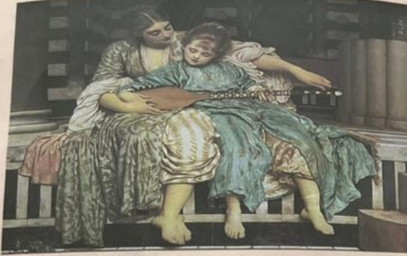
Painter: Frederick Leighton (1830-1896), England

Leighton是英國畫家。圖畫中小女孩正在老師的指導下練習六弦琴(類似早期的吉他)。看到老師的左手了嗎?猜猜看,老師在做甚麼呢?